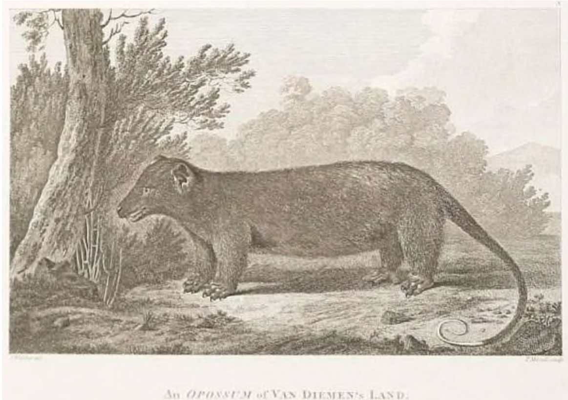
Fig.2. An Opossum of Van Diemen's Land, 1777

It is well known that Webber was the first European who sketched the Tasmanian Aborigines, even though the island had been discovered by Europeans 135 years earlier. The Dutchman Abel Tasman named the island Van Diemen's Land in 1642. He and his crew did not encounter any aboriginal inhabitants. Since then the island had been visited by Marion du Fresne in 1772 and Tobias Furneaux, who captained the Adventure during Cook's second voyage in 1773. While the French expedition under Marion du Fresne did encounter Aborigines, a skirmish broke out and the French had to retreat after shooting one person and wounding several others. A year later, Furneaux did not encounter any aboriginal inhabitants when anchoring at Adventure Bay.