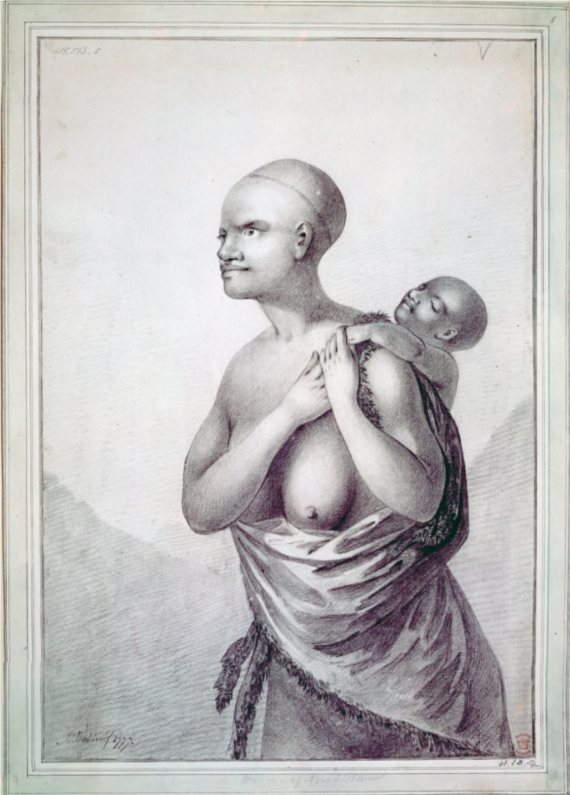
Fig.6. Earlier drawing of "Woman of Van Diemen's Land," 1777