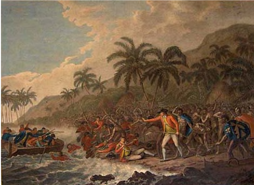
Fig.1. The death of Captain Cook, painted in 1784