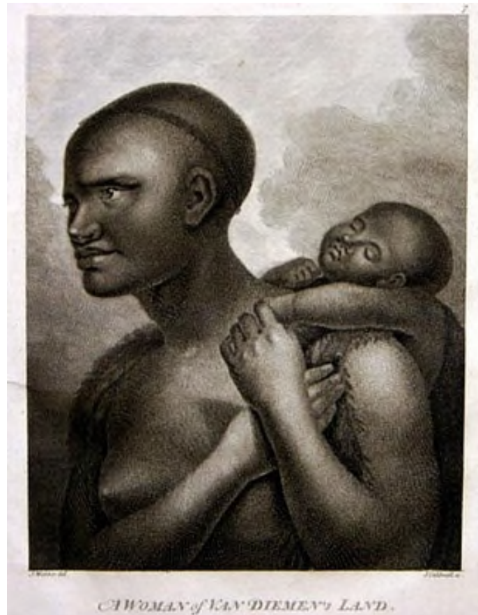
Fig.5. "A woman of Van Diemen's Land," (Nicol and Cadell Plate No 7)

David Samwell was less charitable than Cook, he thought that the women were "the ugliest creatures that can be imagined in human shape" (Rienits 118).