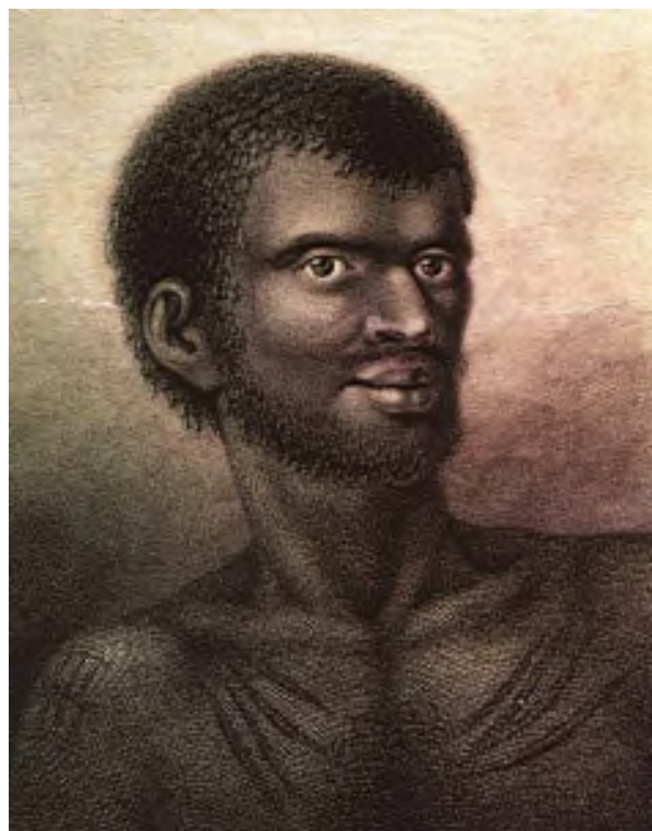
Fig.4. "A man of Van Diemen's Land," (Nicol and Cadell Plate No 6)

Webber's picture of an aboriginal man is that of a handsome black person with the incisions referred to by Cook barely visible.