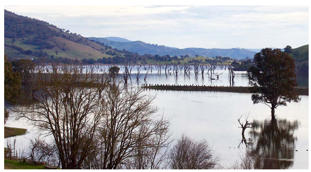
Fig. 2: Site of Old Tallangatta at Lake Hume, July 2017

Albury complained that their water was unfit to drink: "The odor which arises when the house taps are turned on is sickening[.] [...] Residents are tired of the efforts of the weir authorities to clean the water, and are demanding the erection of a filtration plant" (Argus 12/02/1934). The Sydney Mail also identified the dam to be the principal cause of the continuing erosion of grazing land and siltation of the Murray in the previous years. Also, local graziers complained about lagoons and billabongs which were at risk of running dry, due to the absence of periodical floods. This was a "contradictory complex", the reporter found. After all, Hume Dam was a public necessity of the first order, on the other hand, it was obvious that it had severely disturbed the natural flow of the Murray. Albury could even lose its river. In a sceptical note, he concluded: