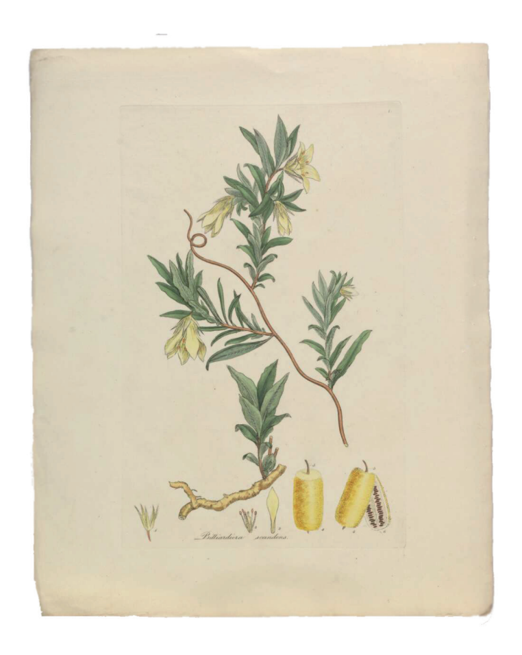
Billardiera scandens. James Edward Smith. A Specimen of the Botany of New Holland. Engraved by James Sowerby. London: J. Davis, 1794

Botanist Jacques-Julien Houtou de Labillardière published his impressive work of the Australian flora, this showed a peak of scientific occupation with exotic plants, and it demonstrated that, in fact, "Paris [had become] the center of botanical development" (Williams 2001: 1).