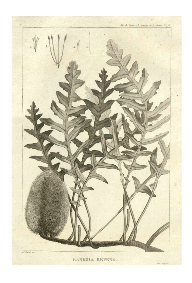
Banksia repens. Atlas pour servir à la relation du voyage à la recherche de la Pérouse. Plate no. 23 Engraved by Pierre-Joseph Redouté. Paris: H.J. Hansen, 1800; Chez Dabo 1817. © Courtesy of National Library of Australia PIC Vol. 592 #U8147/26 NK 3030

Habitat research and the aesthetic performance of the exotic appeared to be two essential aspects which enlightened botanists tried to satisfy with their publications. This, in particular, was a challenge for botanical artists as well as for gardeners who were on the payroll of state institutions or wealthy landowners. Therefore, it is worth discussing a few examples which support the thesis that all research on the Australian flora remained theory until illustration and cultivation would transport the exotic into the mind of the people.