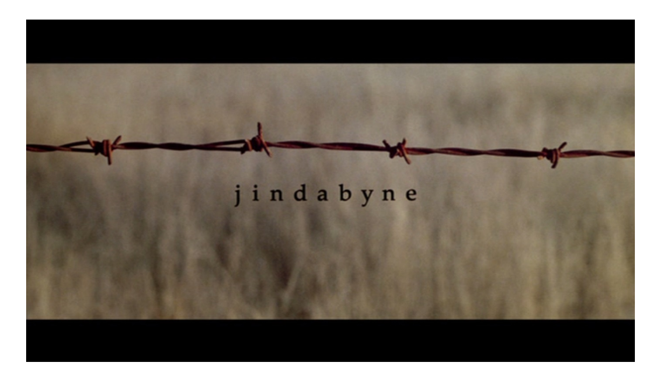
Fig. 1: Opening Shot of Jindabyne